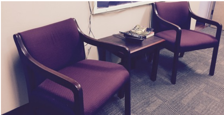
Outside Waiting Area

"People say they feel really comfortable here," adds Odden.