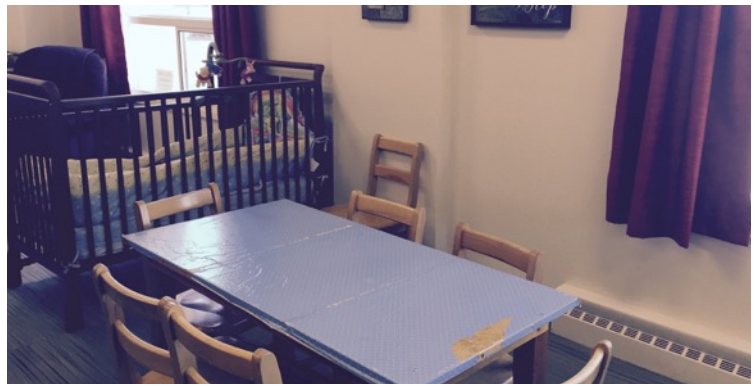
Living / Dining Room